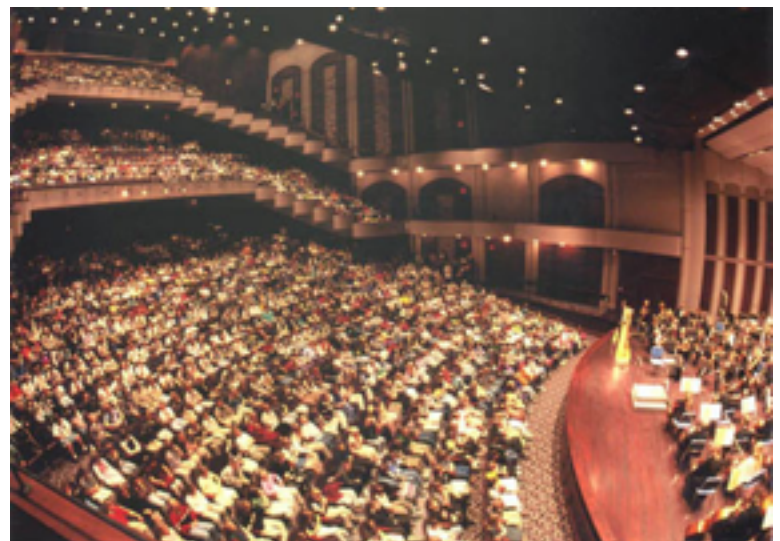
Now Meet The New Auditorium!