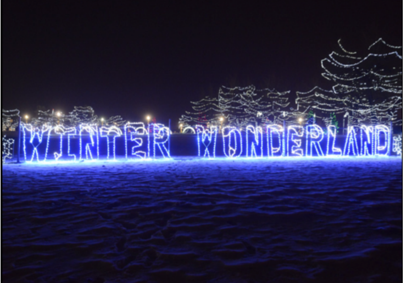
Falls Park in Sioux Falls letting you know you are in Winter Wonderland

“I’ll Be Home for Christmas... If Only In My Dreams.” “Christmas Eve Will Find Me Where The Love Light Gleams.”