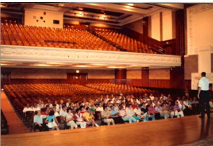
Our Old Auditorium