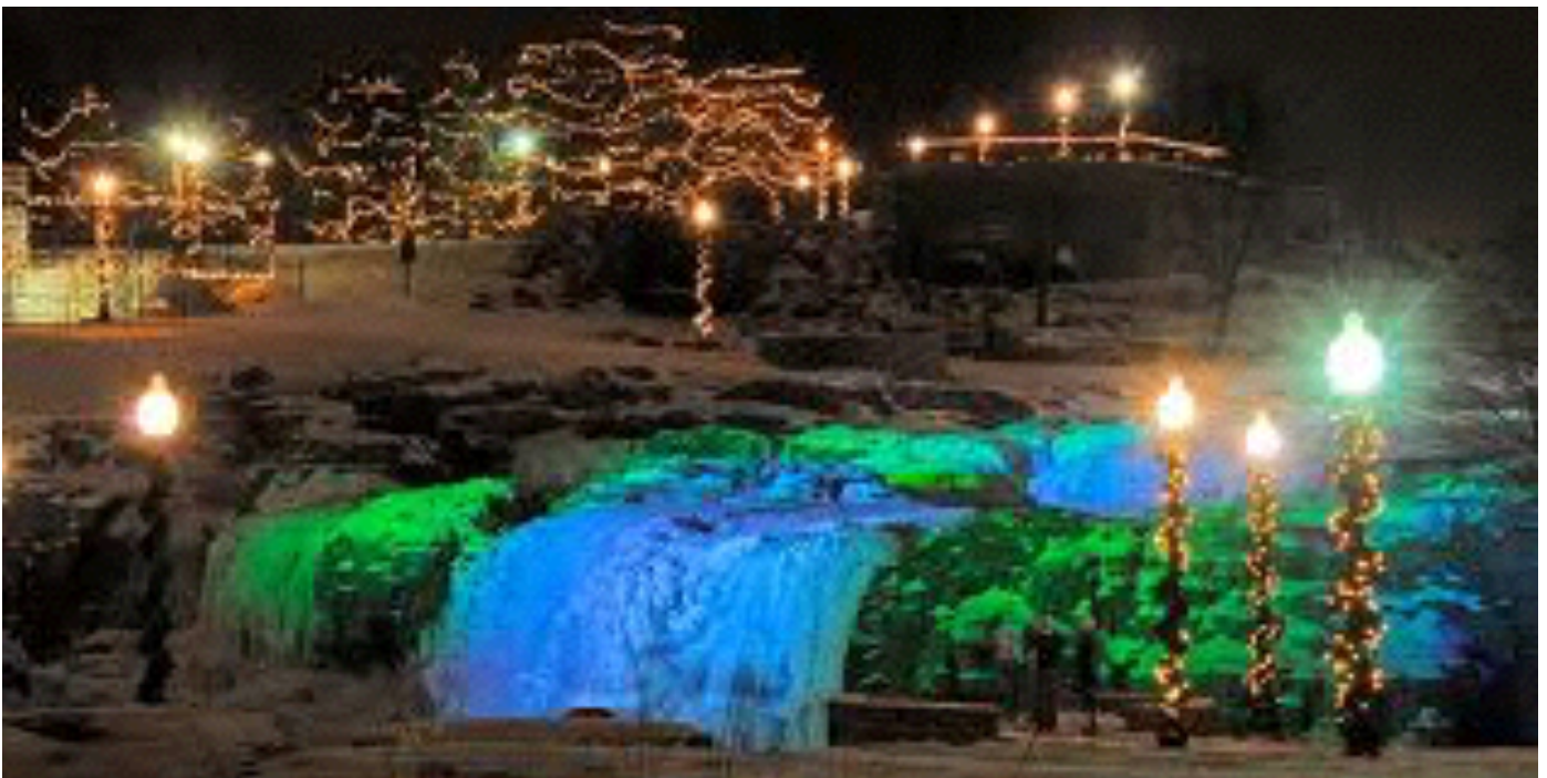
And Of Course, Our Beautiful Falls Park Frozen Majestically