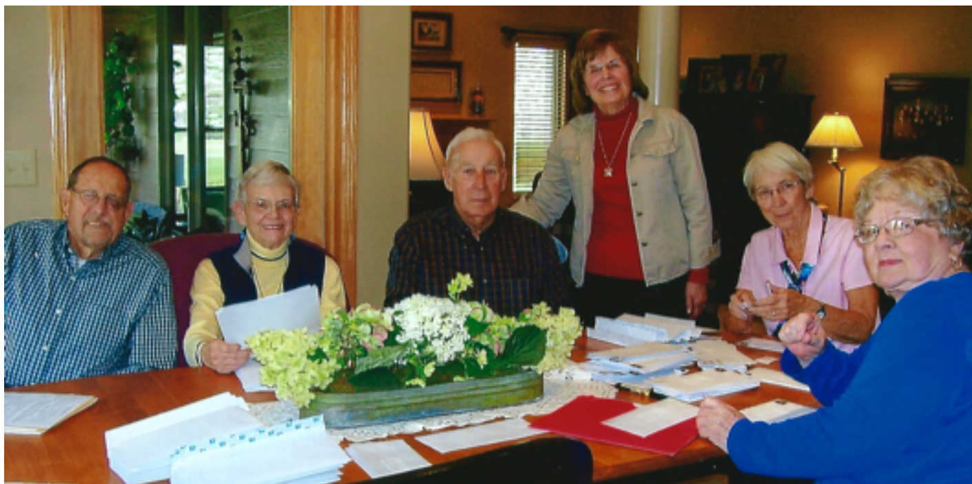
Above: Class of '52 planning their Saturday, Sept. 19, 2015 Luncheon. See Page 4