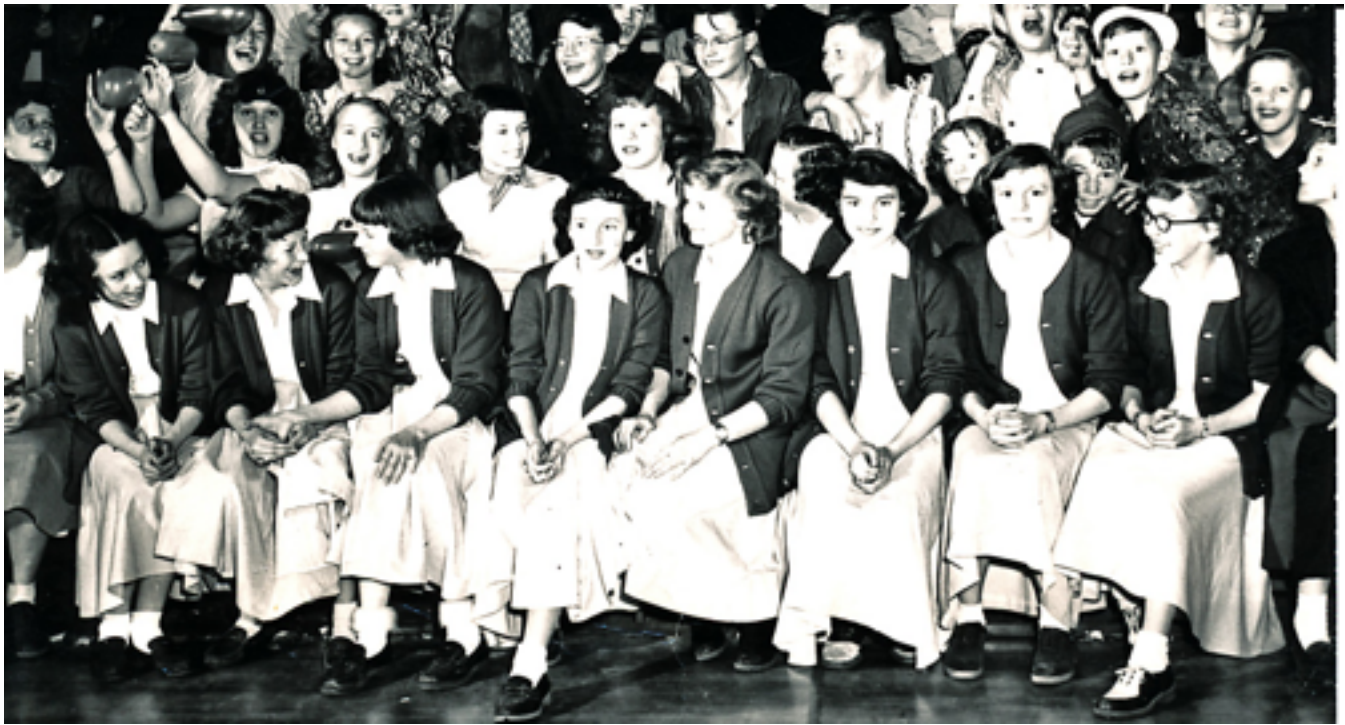
Longfellow Cheer Leaders '48/'49