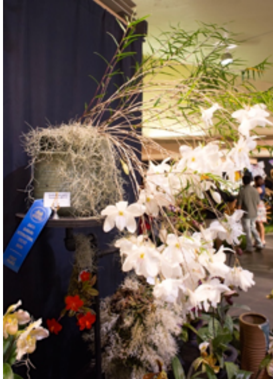
Dendrobium papilio 'Rosminah'