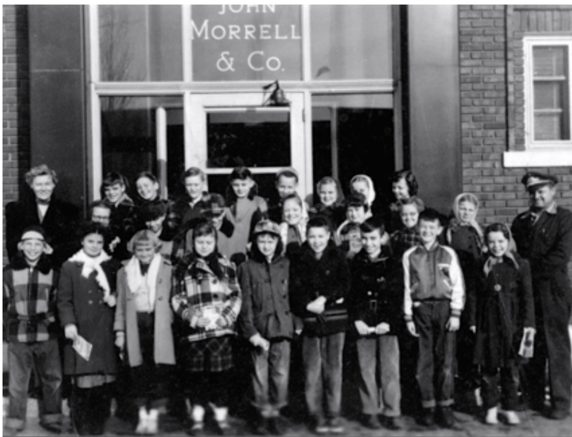
Top Photo: 1951 Jefferson Grand School class touring John Morrell & Co.