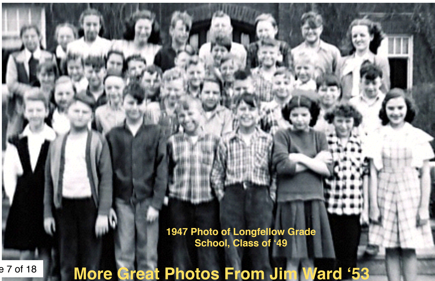
1947 Photo of Longfellow Grade School, Class of '49