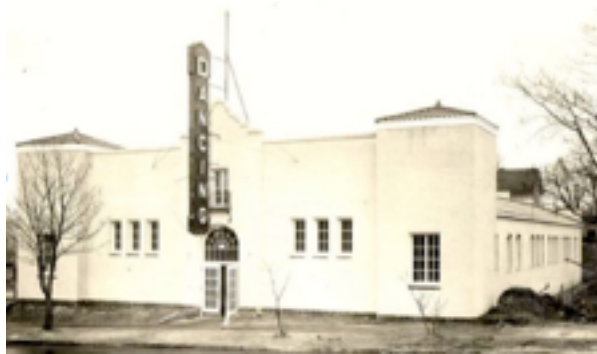
Early Photo of The Arkota Ballroom