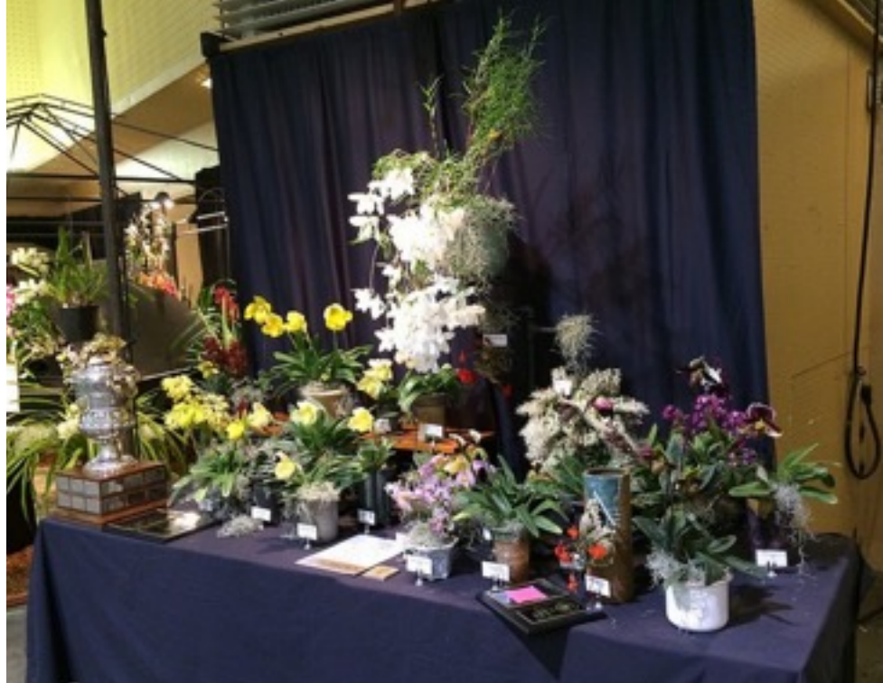
Don Brown's '53 Display, March 2015